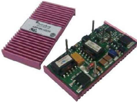
Unit measures 1"W x 2"L x 0.41"H