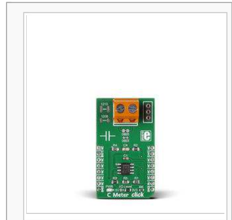
C Meter click