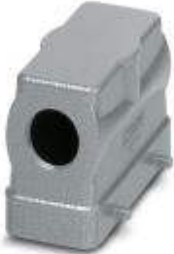
HEAVYCON B16 sleeve housing, for double locking latch, height: 65 mm, with 1 x M25 thread, lateral cable outlet

Please be informed that the data shown in this PDF Document is generated from our Online Catalog. Please find the complete data in the user's documentation. Our General Terms of Use for Downloads are valid ( http://phoenixcontact.com/download )