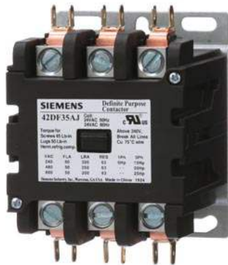
Contactor, 42DP,50A,3P,Open,277 Contactor, 42DP,50A,3P,Open,277