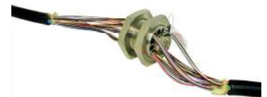
WGF-12 Shown with 24 strand fiber installed