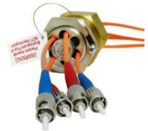
WGF-6 Shown with ST fiber installed