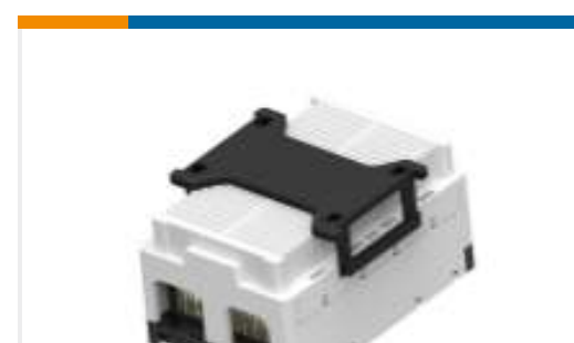
TE Part # 5-1761615-5 STEP-Z RCPT 05MM 200P LF ST