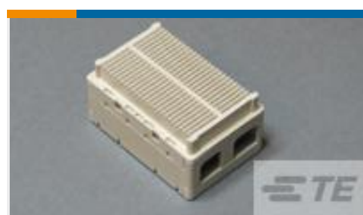
TE Part # 6-1761615-1 STEP-Z RCPT 11MM 200P LF ST