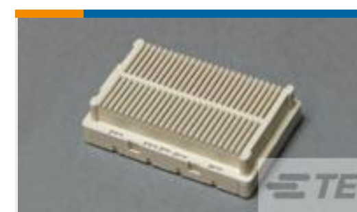
TE Part # 5-2007615-5 STEP-Z RCPT 05MM 200P LF HT