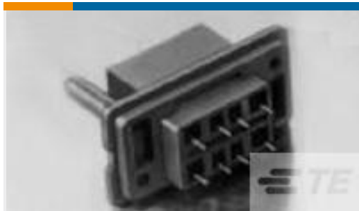
TE Part #172624-3 DRAWER CONN. MALE 24P 4.3MM