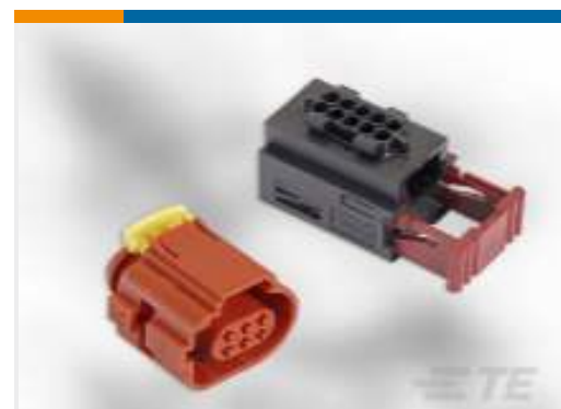
TE Part #1355469-1 Timer Connector Housing