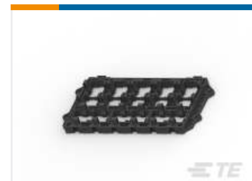
TE Part #444308-1 FRAME, FUSE/RELAY B