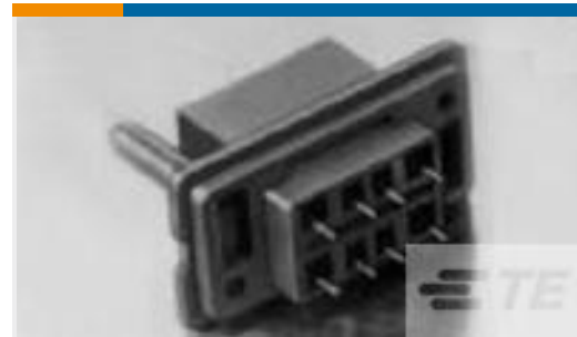
TE Part #5172625-3 DRAWER CONN. FEMALE ASSY 24P