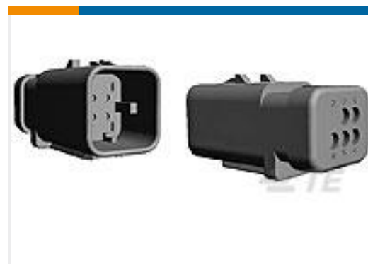
TE Part #776438-4 AS 16, 12P CAP ASSY, KEY, 4