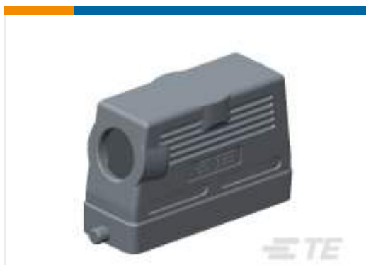
TE Part #T1330240121-000 H24B-TSH-RO-PG21