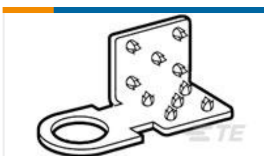
TE Part #276959-2 SPLICE, TERMI-FOIL TAP