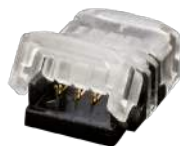
TAPE-TO-TAPE GRIPPER CONNECTOR