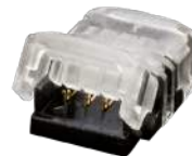
TAPE-TO-WIRE GRIPPER CONNECTOR