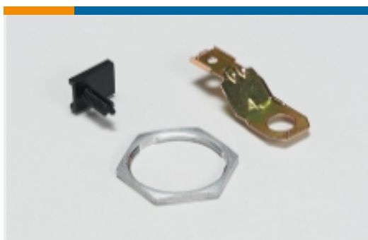
Other Automotive Connector Accessories(5)