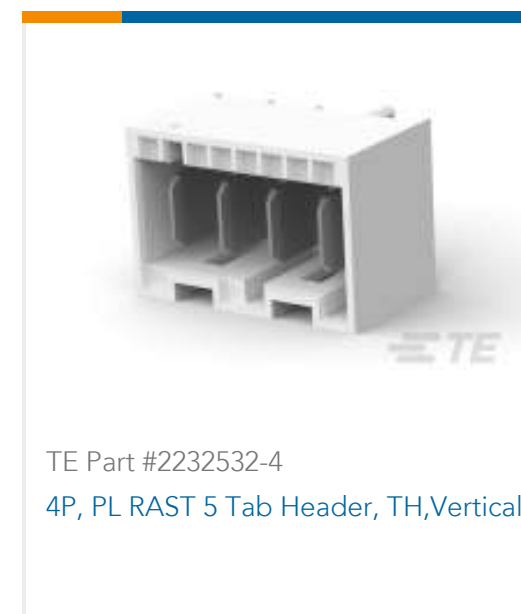
TE Part #2232532-4 4P, PL RAST 5 Tab Header, TH,Vertical