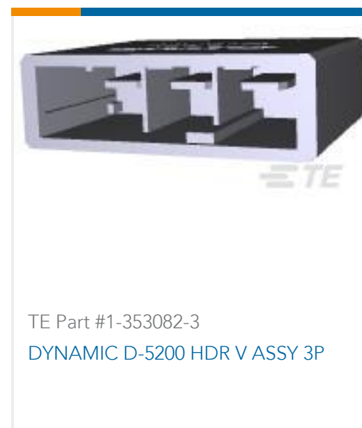
TE Part #1-353082-3 DYNAMIC D-5200 HDR V ASSY 3P