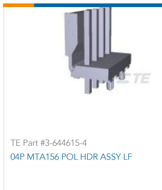
TE Part #3-644615-4 04P MTA156 POL HDR ASSY LF