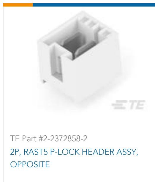
TE Part #2-2372858-2 2P, RAST5 P-LOCK HEADER ASSY, OPPOSITE