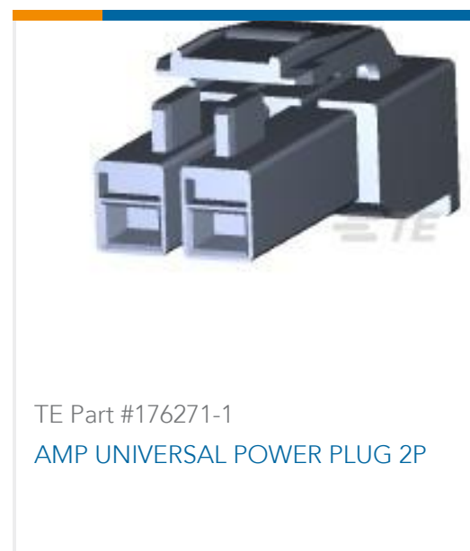
TE Part #176271-1 AMP UNIVERSAL POWER PLUG 2P