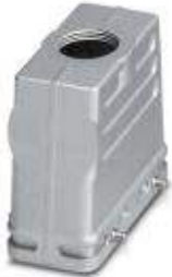
HEAVYCON sleeve housing B16, for double locking latch, height 76 mm, with thread M25, straight cable outlet, EMC version

Please be informed that the data shown in this PDF Document is generated from our Online Catalog. Please find the complete data in the user's documentation. Our General Terms of Use for Downloads are valid ( http://download.phoenixcontact.com )