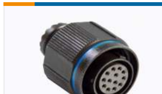
TE Part #DTS26W2544420SAS04 PLUG ASSY.SPLIT FINGER SIZE 4 SKTS. 6.8