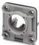
Panel mounting frame, IP67, for Freenet system, for round panel cutout, with grommet, without mounting screws, color: gray

Panel mounting frames - VS-A-F-IP67 - 1653744