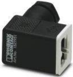
Valve connector, 3-pos., type C, unconnected, screw connection, cable screw connection Pg7

Please be informed that the data shown in this PDF Document is generated from our Online Catalog. Please find the complete data in the user's documentation. Our General Terms of Use for Downloads are valid ( http://download.phoenixcontact.com )