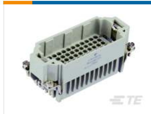
TE Part #T2030722101-000 HDD-072-M