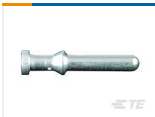
TE Part #T2040001040-000 CMM-4.0