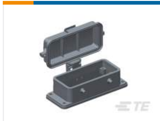
TE Part #T1430160000-000 H16B-AD-BO