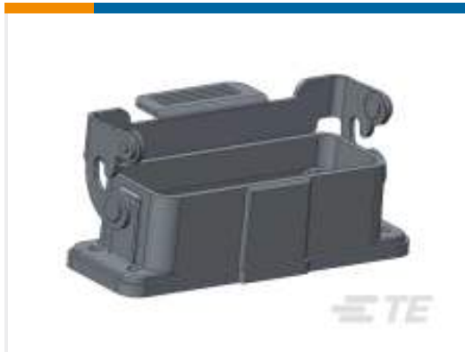
TE Part #T1509161000-000 H16A-AGS