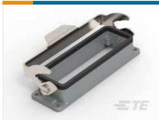
TE Part #T1500243000-000 H24B-AG-LB