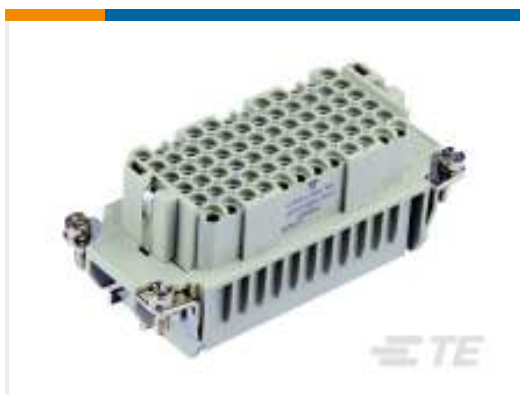
TE Part #T2030722201-000 HDD-072-F