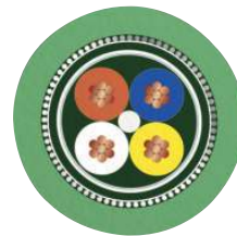
PROFINET PVC stranded CAT5e [93B]