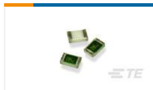
TE Part #1-1879216-8 CPF 0402 76K8 0.1% 25PPM 1K RL