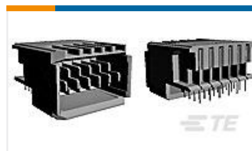
TE Part #5646957-1 UPM EXPANDED PIN ASSEMBLY