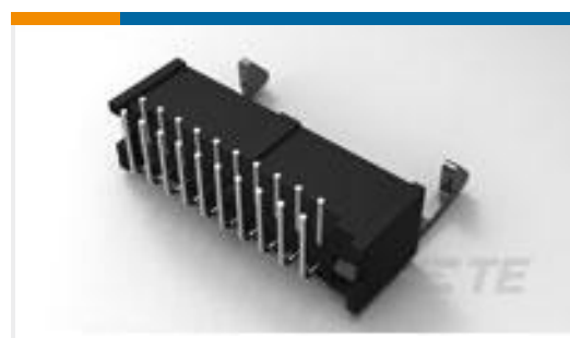
TE Part #1-1761607-5 IDC LOW PRO HDR 50P RA LG LAT BLK