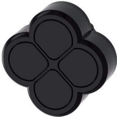
Quadruple pushbutton, 22 mm, round, plastic, black, buttons, flat