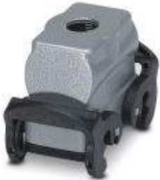
HEAVYCON B10 coupling housing, with double locking latch, height: 62 mm, with 1 x M20 thread, straight cable outlet

Please be informed that the data shown in this PDF Document is generated from our Online Catalog. Please find the complete data in the user's documentation. Our General Terms of Use for Downloads are valid ( http://phoenixcontact.com/download )