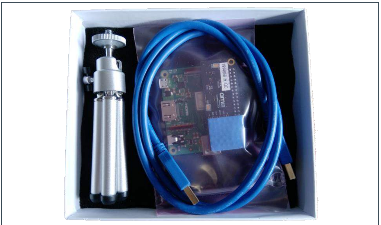
Figure 1: Eval Kit Content