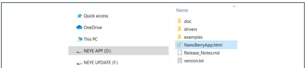
Figure 3: Drives Mounted on PC

Further help and instructions are in the Release_Notes file.md. (it can be opened in any text editor).