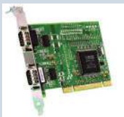
UC-607: uPCI 2xRS232 230K Baud