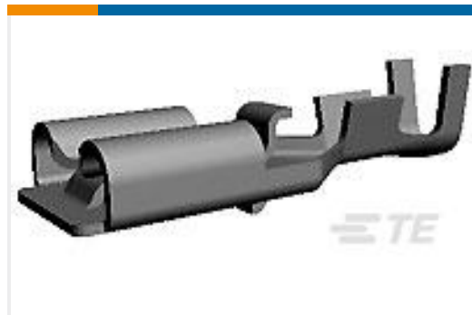
TE Part #179974-1 250 PL EX REC. 18-14AWG PTBR