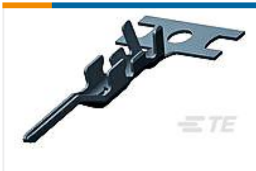
TE Part #2238007-1 TERMINAL, PIN, LANCELESS, 22-26 AWG, EP2