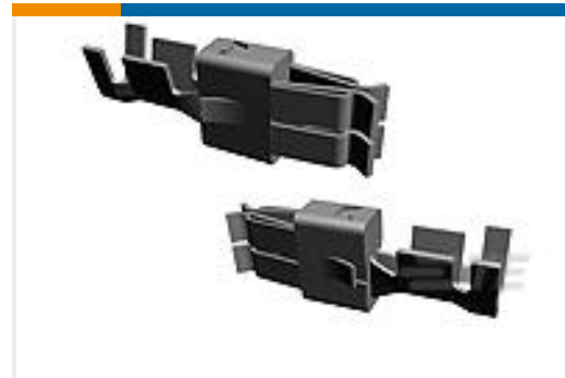
TE Part #964203-1 STD PW TIMER CONTACT