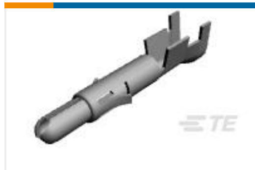
TE Part #350687-2 UMNL SPLIT PIN AUBR