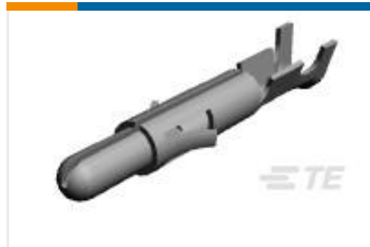
TE Part #350561-2 UMNL PIN 24-18 .0126 AU/BR