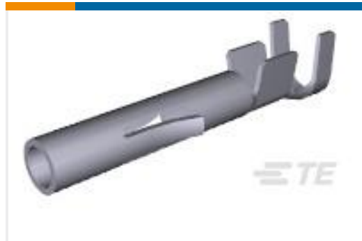
TE Part #350536-2 UMNL SOK 20-14 .0126 AUNI/BR