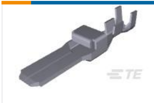
TE Part #917802-2 DYNAMIC D-5 TAB CONT. AU (S)