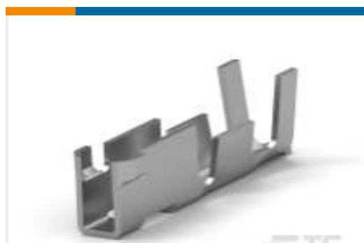
TE Part #2825313-1 .090 CLUSTER REC.