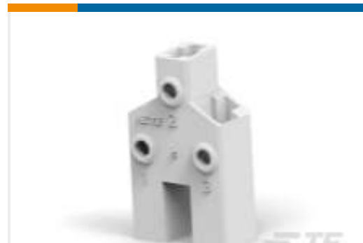
TE Part #2825312-1 CLUSTER BLOCK HSG .090 DIA