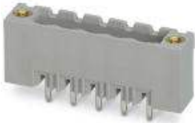
The figure shows a 5-pos. version of the product in gray

Header, Nominal current: 12 A, Rated voltage (III/2): 320 V, Number of positions: 18, Pitch: 5.08 mm, Color: black, Contact surface: Tin, Mounting: Wave soldering