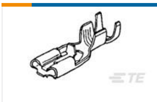
TE Part #170325-1 187 PL MKII REC. 20-16AWG PTBR