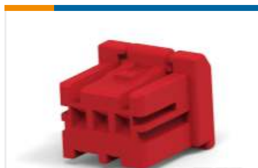
TE Part #1-2232571-2 GIC 2.5 W PLUG HSG 3P RED