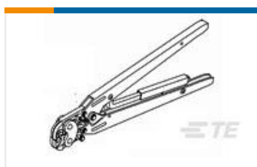
TE Part #753786-1 DAHT 187 POS LOCK 18-14 ASSY