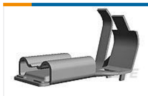
TE Part #175019-1 187 PL EX FLAG REC. 22-16AWG PTBR