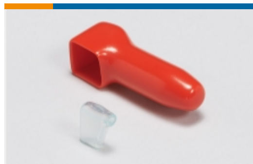
Insulation Boots & Sleeves(7)