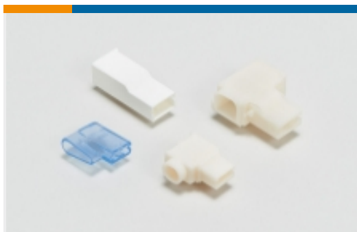
Crimp Terminal Housings(86)