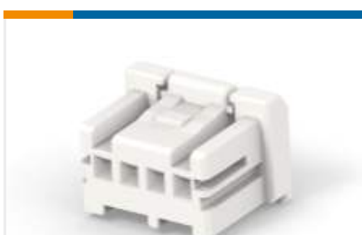
TE Part #2232569-1 GIC 2.5 W PLUG HSG 4P NATURAL