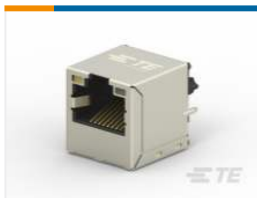
TE Part #5-2301995-3 RJ45 JACK INT.MAG. 10/100 LED 1X1 VERT.