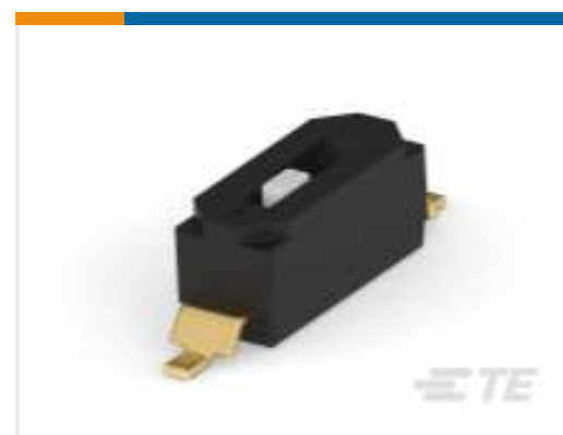
TE Part #6-2319848-4 END STACK DIP1PGRECSSEALT&R VERT.