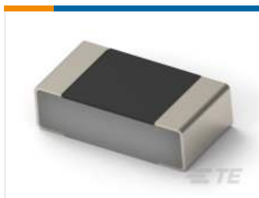
TE Part #2-2176467-3 TLRP 1206 1.0W R004 1% 100PPM 5K RL