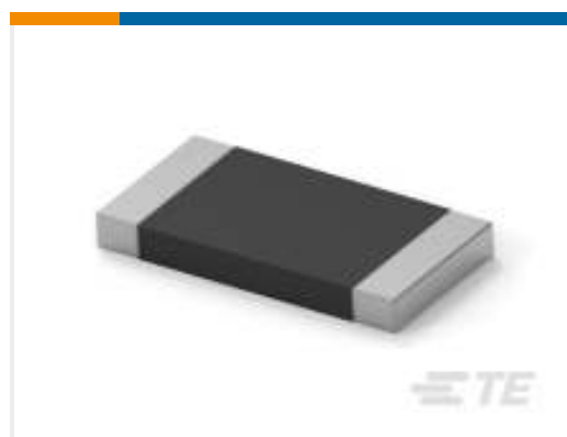
TE Part #6-2176422-9 TLRP 2512 3.0W R068 1% 50PPM 4K RL