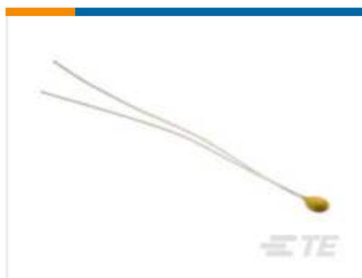
TE Part #GA10K3A1AM DISCRETE 10K, +/-0.05C FROM 32C to 44C