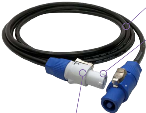
IO-PRCPTP-14-10 (left) IO-PRCPTE-14-25 (right)

Each connector is keyed differently to eliminate the possibility of inter-mating. Locking mechanism virtually eliminates accidental unplugging