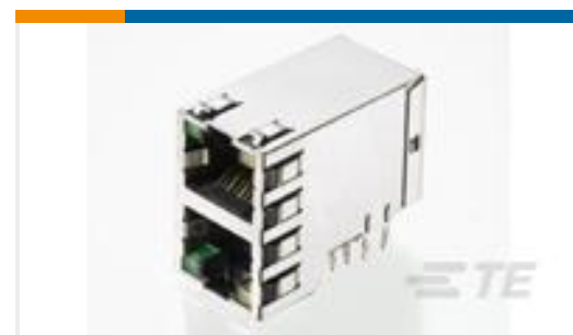
TE Part #1888653-4 2X1 OFFSET ST/JK WITH LEDS