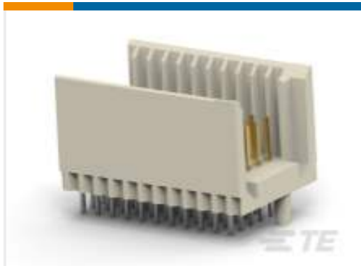
TE Part #5646356-1 Hard Metric Male Connector: Traditional Backplane, Mezzanine, 2mm