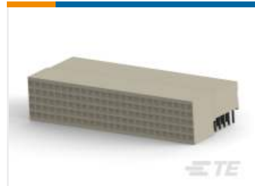
TE Part #5646446-1 HM Receptacle Connector: Traditional Backplane, Coplanar, 2mm