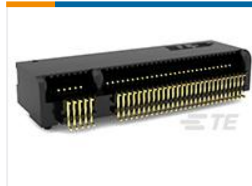
TE Part #1-2199230-6 M.2 0.5PITCH 4.2H KEY M 30U AU