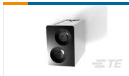
TE Part #1-1469373-1 ATCA GUIDE MODULE RA FEMALE