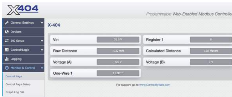
Web-Based Control Page Example