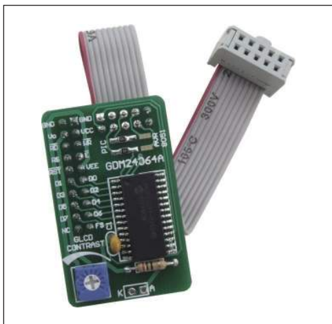
Figure 1: Serial GLCD 240x64 Adapter