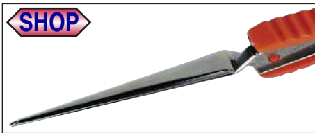
Pointed Self Closing Long Straight