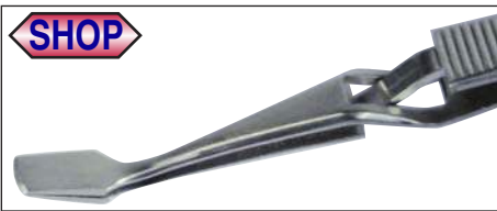
Bent Flat Square End 5mm Wide