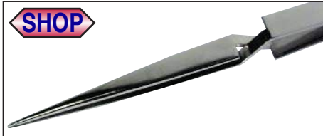
Pointed Self Closing LD Long Straight