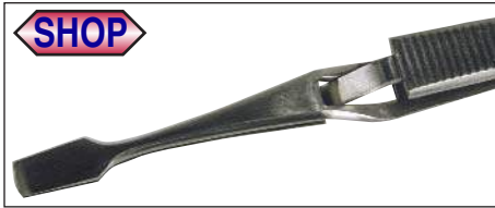
Straight Flat Square End 5mm Wide