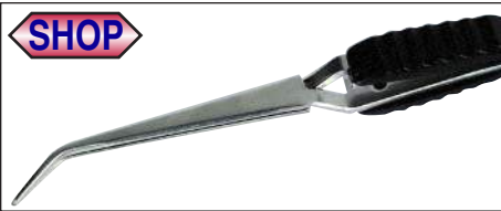
Long Bent Tweezers