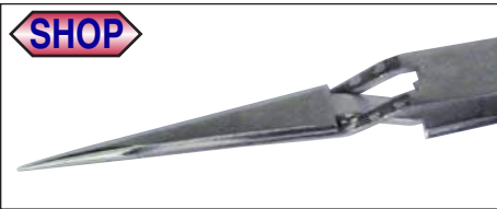
Reverse 3 Fine Round Points For Assembly