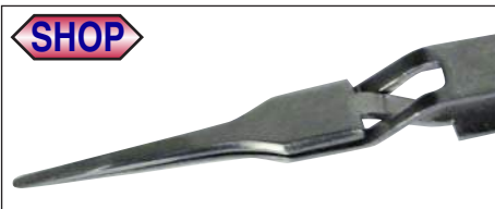
Reverse 2 Flat Round Tip Smooth Sides