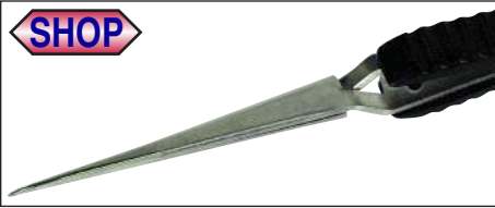
Long Straight Tweezers