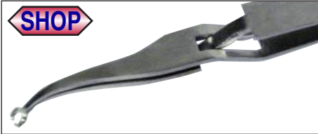
Chip Holding Curved Fine Micro Tip