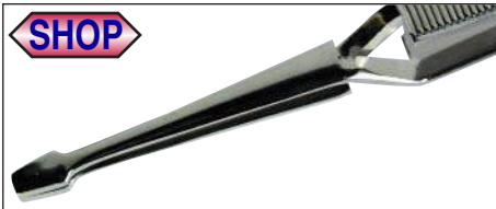
Strong With Square Ends Deep Serrated