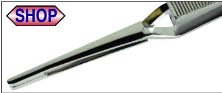
Blunt Heat Dissipating Copper Tips