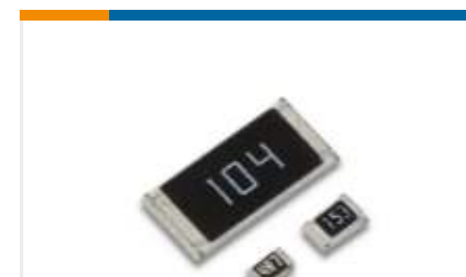
TE Part #2-2176347-1 CRGCO 2010 470R 1%