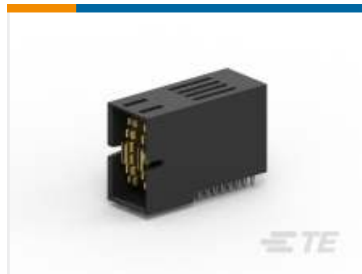
TE Part #2204443-1 MULTI-BEAM HD R/A PLUG 2P