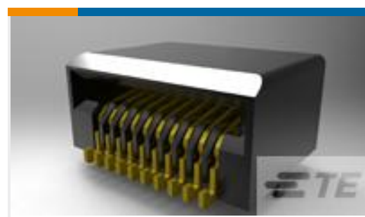
TE Part #2170088-1 ZSFP+ Connector, 30u"