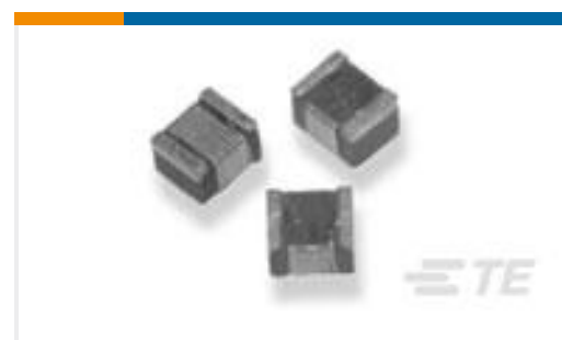
TE Part #5-1624112-9 3650 0603 1.6nH 5% 2K RL