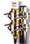
FM2 Mounting Kit (Sold separately)