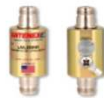
Lightning Arrestor LABH350NN (Sold Separately)