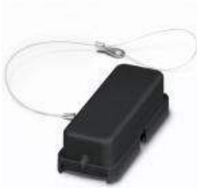
HEAVYCON protective cover, D25, for HC-EVO-D25... supporting base element, for single locking latch, with retaining cord with combination eyelet, IP54, PA

Please be informed that the data shown in this PDF Document is generated from our Online Catalog. Please find the complete data in the user's documentation. Our General Terms of Use for Downloads are valid ( http://phoenixcontact.com/download )