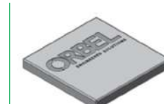
Logo or Part Number Marking