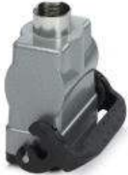
HEAVYCON B10 coupling housing, with single locking latch, height: 77.5 mm, with 1 x Pg21 gland, straight cable outlet

Please be informed that the data shown in this PDF Document is generated from our Online Catalog. Please find the complete data in the user's documentation. Our General Terms of Use for Downloads are valid ( http://phoenixcontact.com/download )