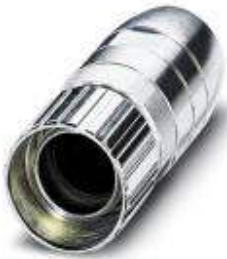
Sleeve housing for cable connector, straight, Screw locking, M23, Shielded: Yes, Cable cross section: 10 mm...14 mm

Please be informed that the data shown in this PDF Document is generated from our Online Catalog. Please find the complete data in the user's documentation. Our General Terms of Use for Downloads are valid ( http://download.phoenixcontact.com )