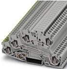
Installation level terminal block, Spring-cage connection, Cross section: 0.08 mm 2 - 4 mm 2 , AWG: 28 - 12, Width: 5.2 mm, Color: gray, Mounting type: NS 35/7,5, NS 35/15

Please be informed that the data shown in this PDF Document is generated from our Online Catalog. Please find the complete data in the user's documentation. Our General Terms of Use for Downloads are valid ( http://download.phoenixcontact.com )