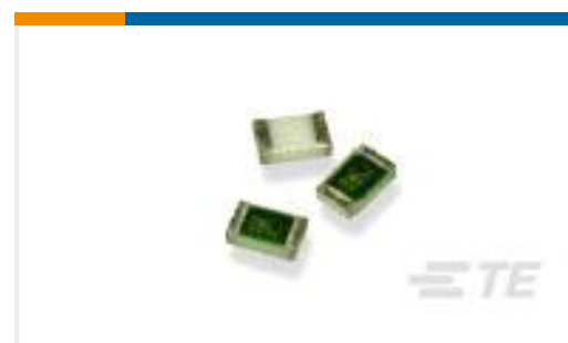
TE Part #3-1879216-5 CPF0402 200K 0.1% 25PPM 1K RL