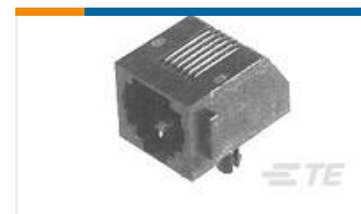
TE Part #5555167-1 MJ,LPF,R/A,8P/8C,KEYED,BULK P