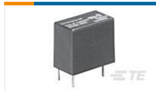
TE Part #1-1393194-5 T77S1D3-12