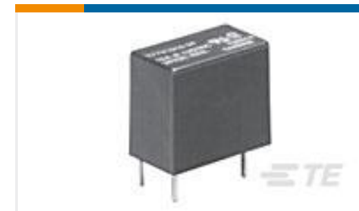
TE Part #1-1393194-8 T77V1D10-05