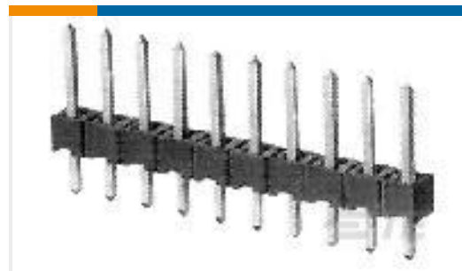
TE Part #826926-3 3P AMPMODU II PIN HDR.