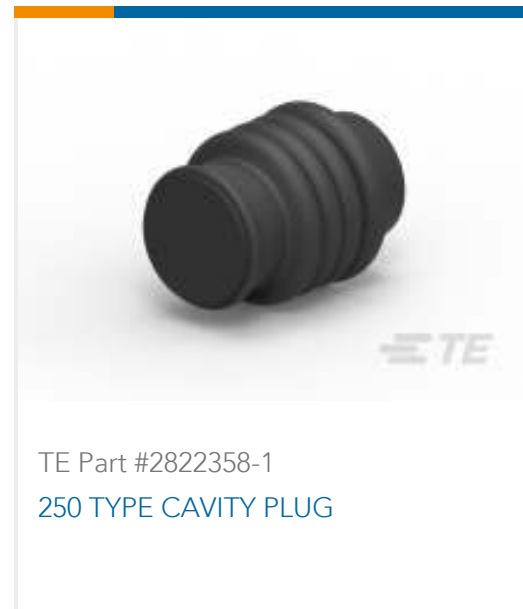
TE Part #2822358-1 250 TYPE CAVITY PLUG