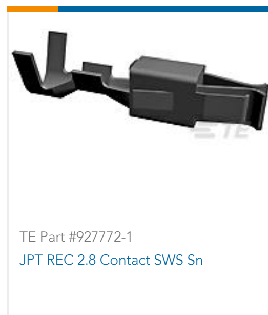
TE Part #927772-1 JPT REC 2.8 Contact SWS Sn