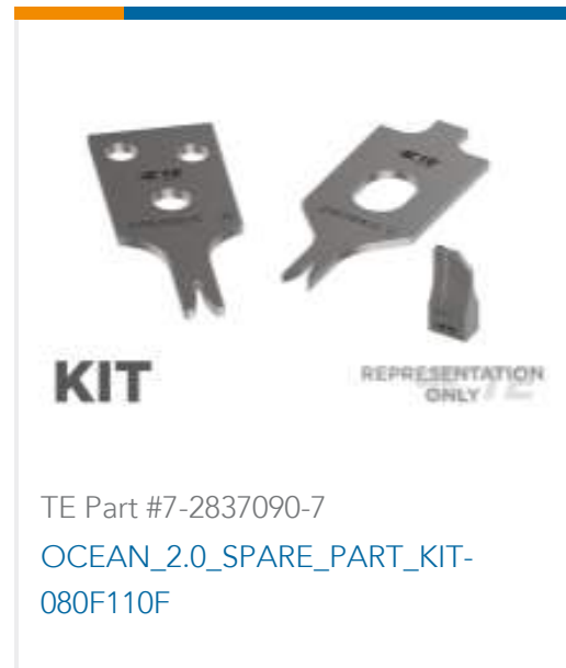
TE Part #7-2837090-7 OCEAN_2.0_SPARE_PART_KIT- 080F110F