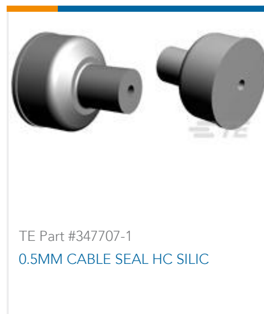
TE Part #347707-1 0.5MM CABLE SEAL HC SILIC