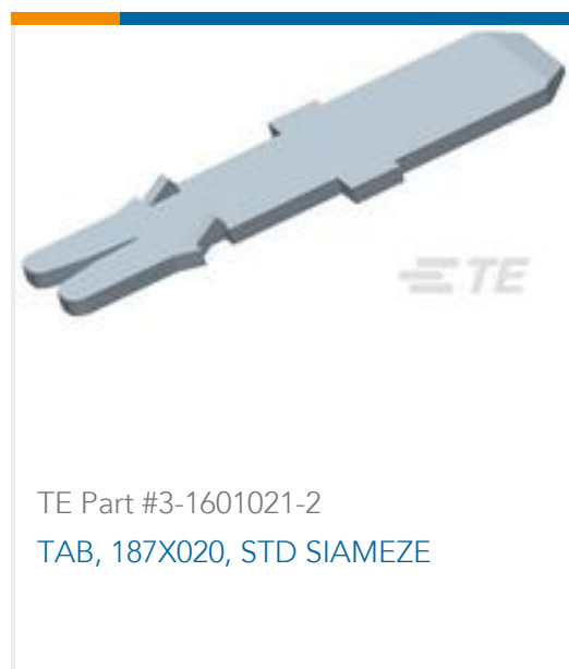
TE Part #3-1601021-2 TAB, 187X020, STD SIAMEZE