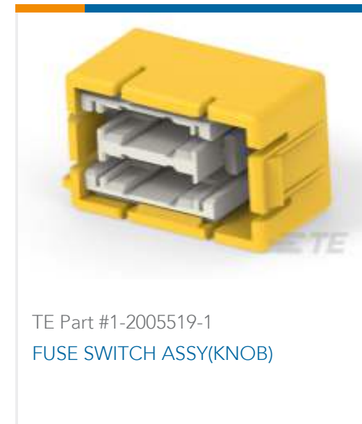
TE Part #1-2005519-1 FUSE SWITCH ASSY(KNOB)