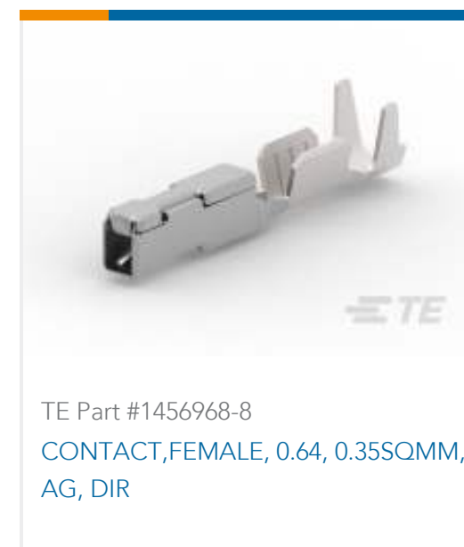
TE Part #1456968-8 CONTACT,FEMALE, 0.64, 0.35SQMM, AG, DIR