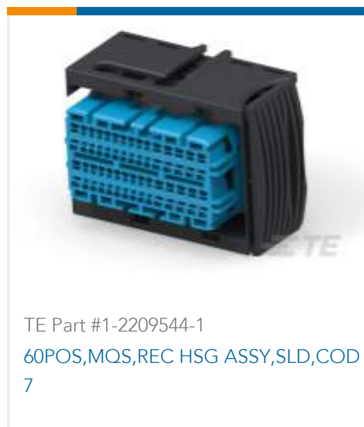
TE Part #1-2209544-1 60POS,MQS,REC HSG ASSY,SLD,COD 7