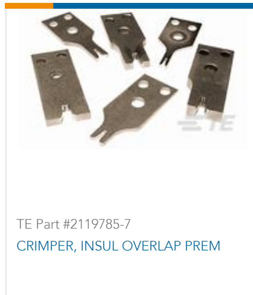
TE Part #2119785-7 CRIMPER, INSUL OVERLAP PREM