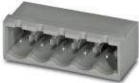
The figure shows a 5-pos. version of the product in gray

Header, Nominal current: 12 A, Rated voltage (III/2): 320 V, Number of positions: 2, Pitch: 5 mm, Color: black, Contact surface: Tin, Mounting: Wave soldering