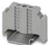
End clamp, width: 9.5 mm, color: gray