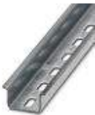
DIN rail, material: Galvanized, perforated, height 15 mm, width 35 mm, length: 2 m

DIN rail - NS 35/15 ZN PERF 2000MM - 1206599