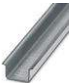
DIN rail, material: Galvanized, unperforated, height 15 mm, width 35 mm, length: 2 m

DIN rail - NS 35/15 ZN UNPERF 2000MM - 1206586