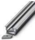
DIN rail, deep drawn, high profile, unperforated, 1.5 mm thick, material: aluminum, height 15 mm, width 35 mm, length 2000 mm

DIN rail, unperforated - NS 35/15 AL UNPERF 2000MM - 1201756