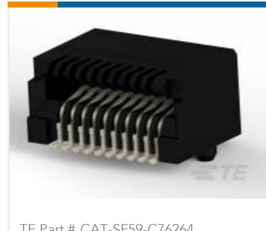
TE Part # CAT-SF59-C76264 SFP Connectors