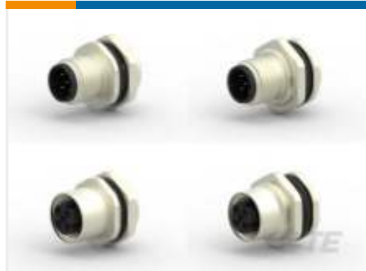
TE Part #T4131012121-000 M12 Panel Mount Solder Cups