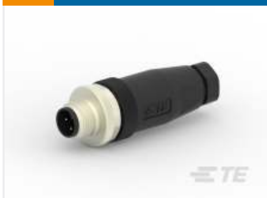
TE Part # T4111001041-000 RPC-M12-MS-4CON-PG7-MU