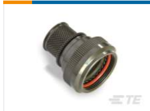
TE Part #EK4828-000 91H1-11-06-1-C-HE100