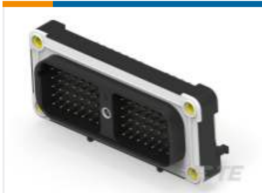
TE Part #DRC13-70PA-B027 HDR, 70P, BLK, RA, M5, FLG, NI/CU, A