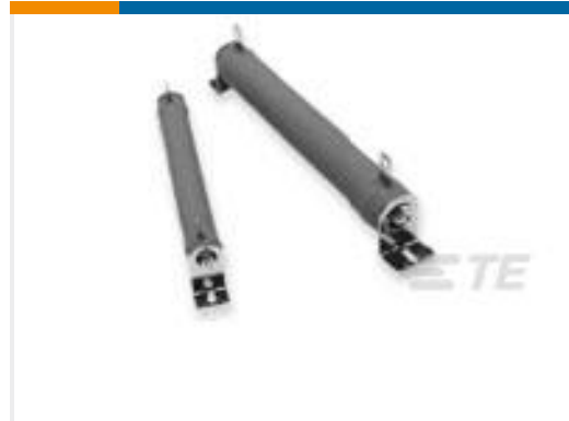
TE Part #1879448-6 TE 300W 2R7 5% Bracket