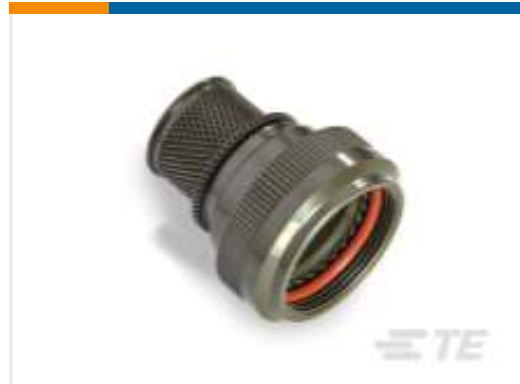
TE Part #EK4831-000 91H1-13-08-1-C-HE200