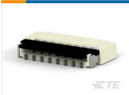
TE Part #3-2328724-1 31PIN 0.3MMP FPC CONNECTOR, FRONT FLIP