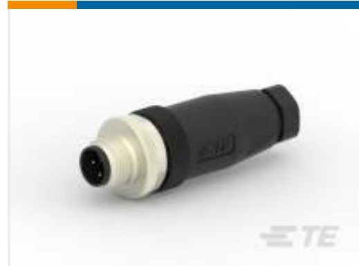
TE Part #T4111001041-000 RPC-M12-MS-4CON-PG7-MU