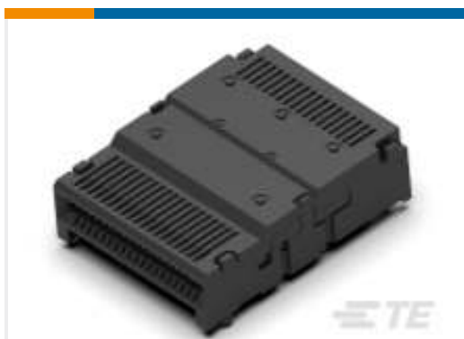
TE Part #2318579-1 RCPT CONN R/A SMT 76 POSN QSFP- DD