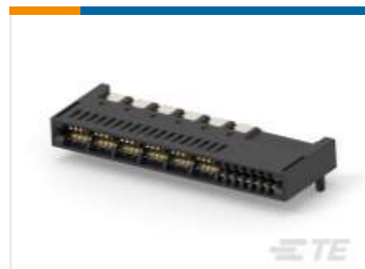
TE Part #2343428-1 HD+ CE, RA, CRPS