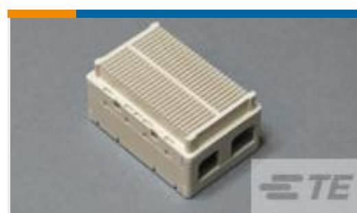
TE Part # 6-1761617-5 STEP-Z RCPT 15MM 296P LF ST