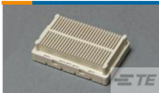
TE Part #5-1761617-5 STEP-Z RCPT 05MM 296P LF ST