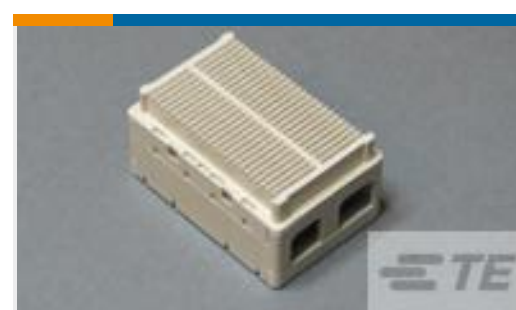
TE Part # 6-1761617-1 STEP-Z RCPT 11MM 296P LF ST