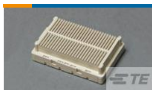
TE Part # 5-1761617-5 STEP-Z RCPT 05MM 296P LF ST