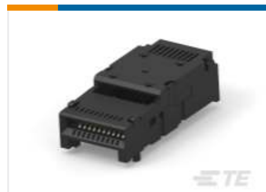
TE Part #2325864-1 SFP-DD RECEPTACLE ASSEMBLY