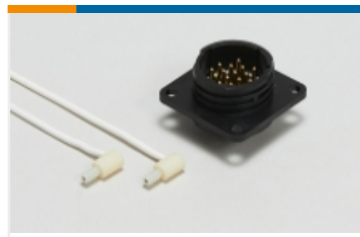
Circular Power Connectors(2)