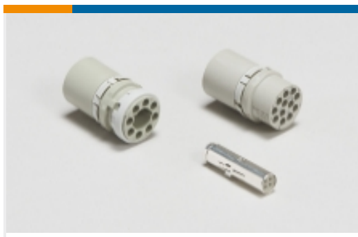
Circular Connector Contact Inserts(5)