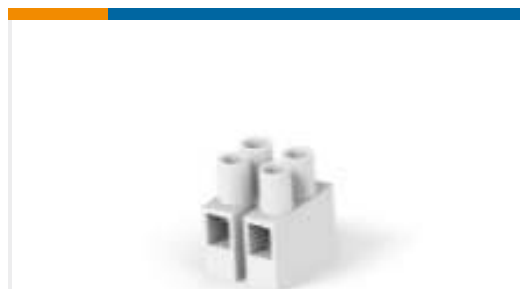
TE Part # 1776322-2 TSB230K 02DS=EUROPA TRM BLK, 8MM