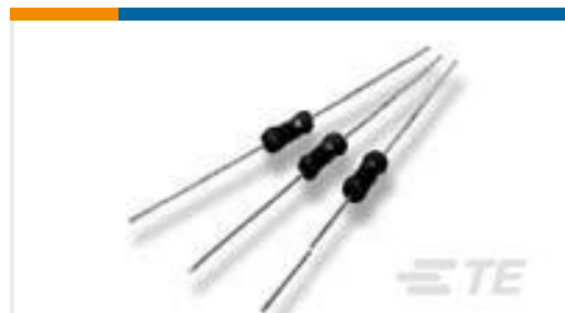
TE Part #1-1625890-4 2W SM M/OX 5% 15K