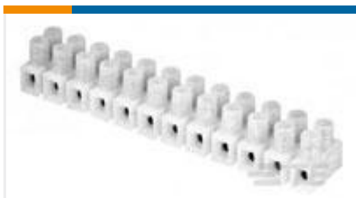
TE Part # 1776294-2 TSB23002=EUROPA TERM BLK,8MM