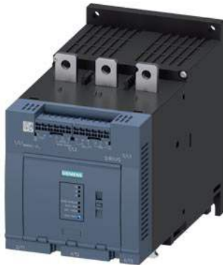
SIRIUS soft starter 200-480 V 470 A, 110-250 V AC Spring-loaded terminals Thermistor input