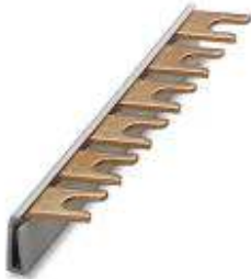
Wiring bridge for modules with connecting pitch 17.5 mm, 1-phase, 3-pos.

Please be informed that the data shown in this PDF Document is generated from our Online Catalog. Please find the complete data in the user's documentation. Our General Terms of Use for Downloads are valid ( http://download.phoenixcontact.com )