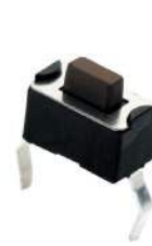
Thru-Hole, 160g, Brown Actuator

Used in applications such as consumer electronics, audio equipment, PCs, VCRs, cable boxes, modems, communications equipment, controls, security and alarm equipment, and test and measurement equipment.