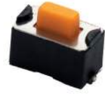
Gull Wing, 320g, Orange Actuator