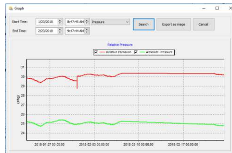
Stored Data in Graph Format

For further information contact: Tyconsystems.com